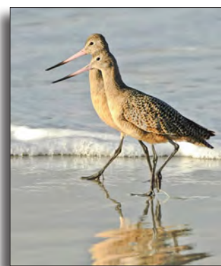
Marbled Godwit Pair