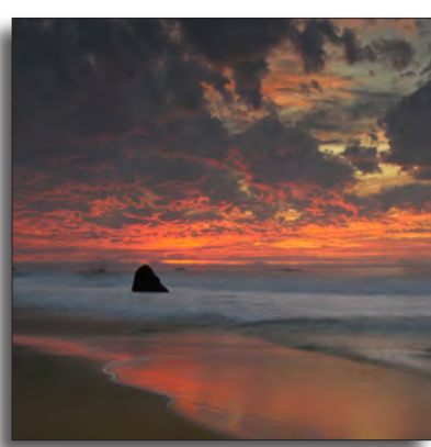
Garrapata Fire Sunset