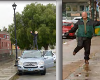
Below: Drone's eye view of the lunch table folks