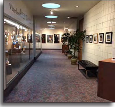
Avery Gallery images by Ken Jones

before, but many are learning as they go what it takes to have their selected images printed and framed for the gallery. Our target is to have 70 framed prints ready by April. The images in this exhibit will be an eclectic interpretation of the general theme of the