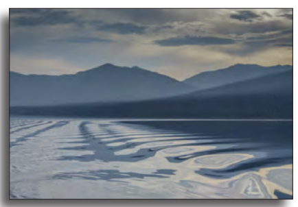
Silver Wake on Lake McDonald